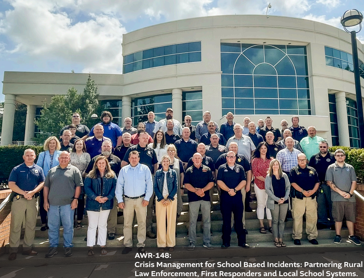
AWR-148: Crisis Management for School Based Incidents: Partnering Rural Law Enforcement, First Responders and Local School Systems.